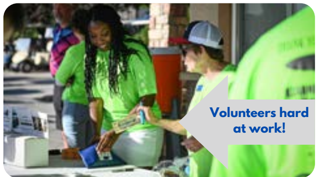
Volunteers hard at work!